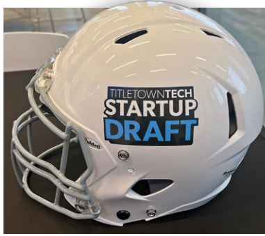
Startup Draft hosted by TiletownTech