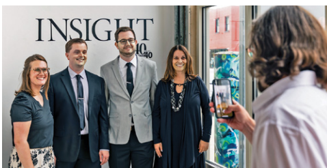
Partnered with Insight Publications to recognize 40 under 40 alumni at New North Summit