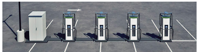
Excellerate launched ready-to-install EV charging system