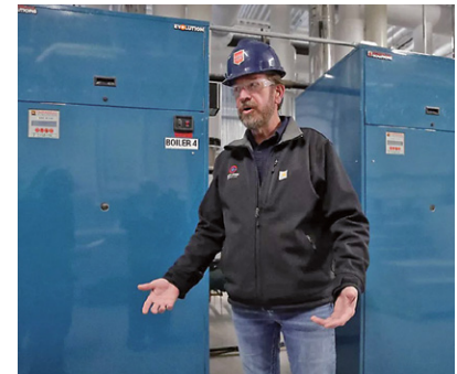
Masters Gallery Foods, Oostburg, incorporated geothermal heating and other technology to increase sustainability efforts