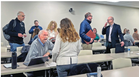
New North Economic Development Council brings together local partners, fostering collaboration and long-term prosperity for all in the region