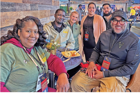
NFL Draft Source to match businesses with procurement opportunities