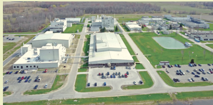
Millipore Sigma , Sheboygan Falls completed its first new lateral flow membrane production facility in the United States.