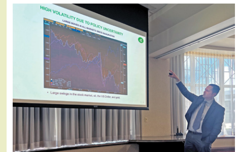
The Spring Economic Intel Forum at St. Norbert College featured the state and regional impact of tariffs on global trade.