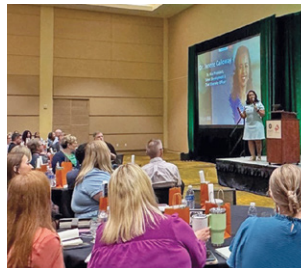
Leveraging Psychological Safety to Fuel Innovation