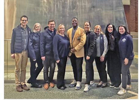
Business of the Draft Statewide Tour Getting communities ready for the Draft