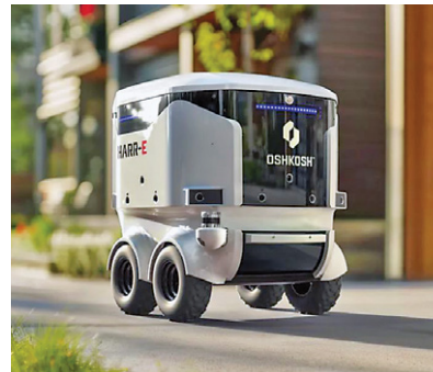
Oshkosh Corp. unveiled a trash-collection robot at a national consumer electronics show