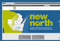
New North Website thenewnorth.com

As a thank you for your support, investors are highlighted through: