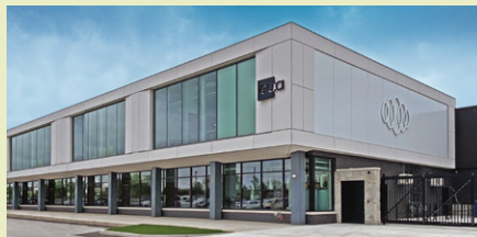
EUA partnered with the Green Bay Packers for a new two-story, multitenant building that includes its New North office in Ashwaubenon.