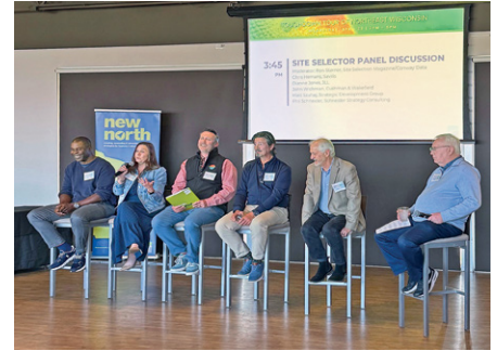
Panel Discussion with site selectors during the Draft