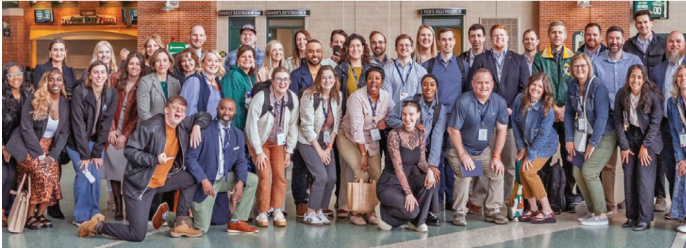
Forward 48 May 2025 Graduation