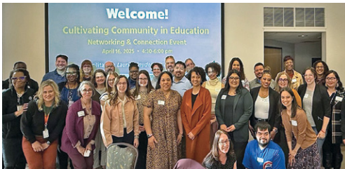
Bellin College, St. Norbert, UW-Green Bay, NWTCC, Green Bay Area Public Schools: Cultivating Community in Education