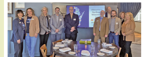
Mission Trip to Atlanta Local partners along with ATW, GRB, BioForward and Wisconsin Lighting Lab hosted a luncheon for site selectors in Atlanta.