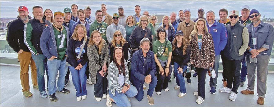
Touchdown Tour hosting site consultants to showcase development opportunities