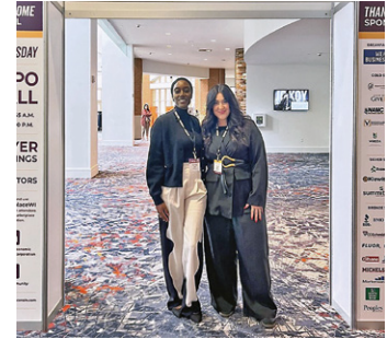
Marketplace Governor's annual conference on diverse business development