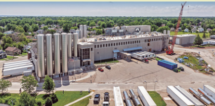
Galloway Company , Neenah completed a $70 million expansion that doubled the nation's capacity for industrial sweetened condensed milk.

*Sampling of development projects. More business development videos featured on our website.