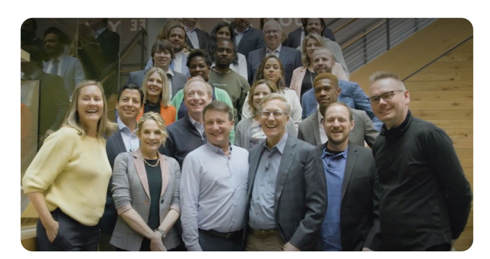
TechSpark communities thriving in new ways through strategic collaboration with government, nonprofits, businesses and community.