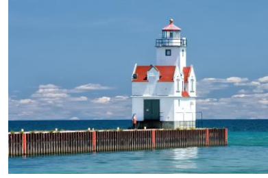
Kewaunee Pierhead Lighthouse.