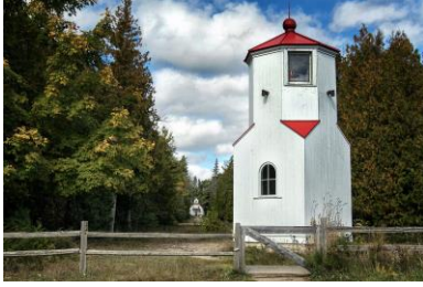
Baileys Harbor Range Lights.